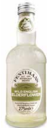
010176 Fentimans Wild English Elderflower