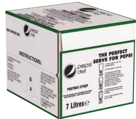
050204 Diet Pepsi