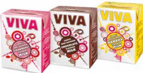
Viva Milkshake Drinks