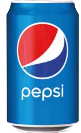
078218 Pepsi Cola