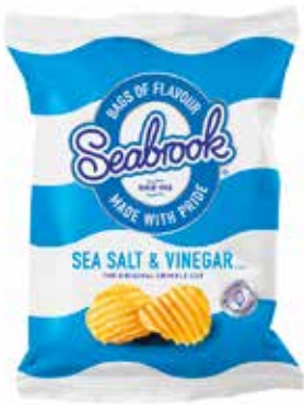
070109 Seabrook Salt & Vinegar Crisps