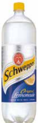
022857 Schweppes Lemonade