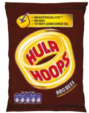
051336 Hula Hoops Barbecue