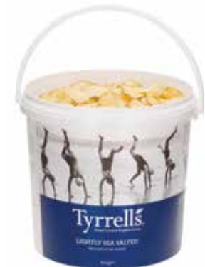
080692 Tyrrells Potato Crisps with Sea Salt (Tub)