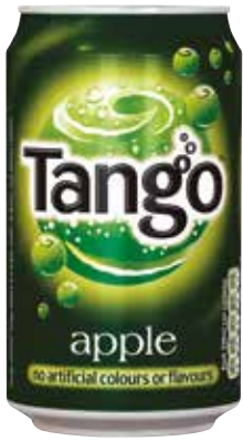
105571 Tango Apple