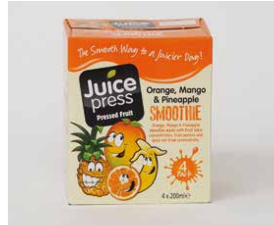
041850 Juice Press Smoothie Orange, Mango & Pineapple