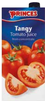
040057 Princes Tomato Juice