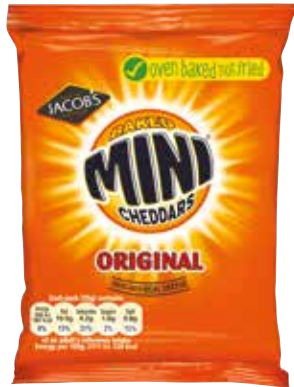
063175 McVities Mini Cheddars