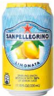
060173 San Pellegrino Lemon