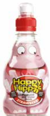
090339 Wild Waters Strawberry (Hippo)