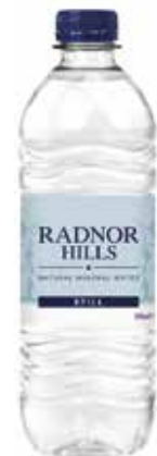
090427 Radnor Hills Still Mineral Water