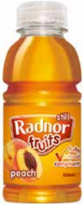
010635 Radnor Splash Still Water Peach