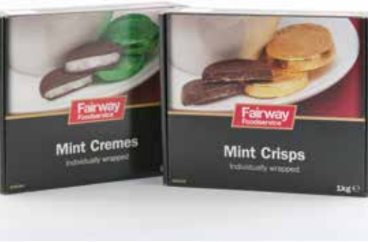
070294 Fairway Mint Cremes 070286 Fairway Mint Crisps