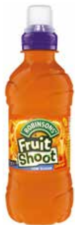
188870 Robinsons Fruit Shoot Orange (NAS)