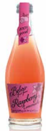
080495 Belvoir Fruit Presse Raspberry Lemonade