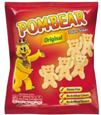
165062 Pom-Bear Mono Original