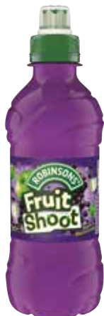
188864 Robinsons Fruit Shoot Blackcurrant & Apple (NAS)