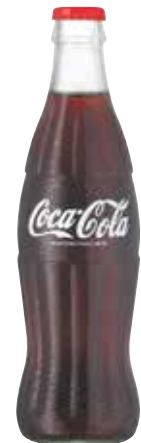
130702 Coca Cola - Glass