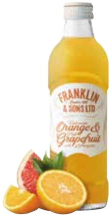
071080 Franklins Orange & Grapefruit