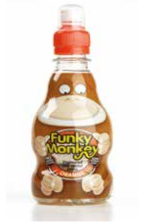
090331 Wild Waters Orange (Monkey)