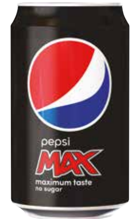
061896 Pepsi Max