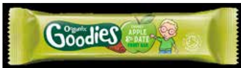
010527 Goodies Apple & Date Chunky Fruit Bars