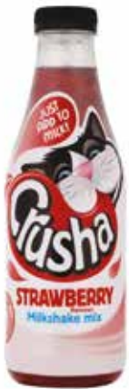
177756 Crusha Syrup Strawberry Milkshake