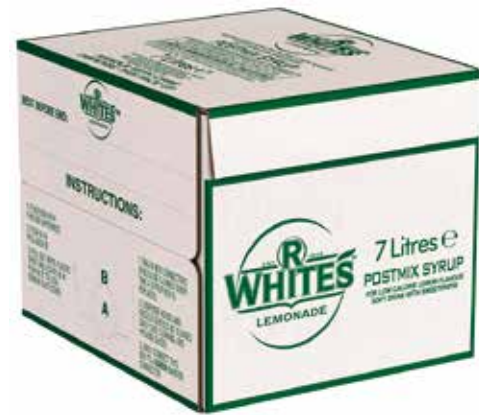
028880 R White's Lemonade