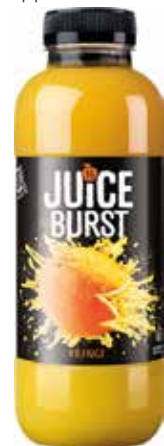
054090 Juice Burst Orange Juice