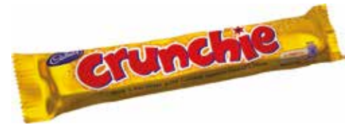
011539 Cadbury Crunchie