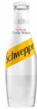
027479 Schweppes Slimline Tonic