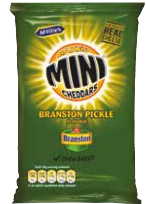
040024 McVities Mini Cheddars Branston