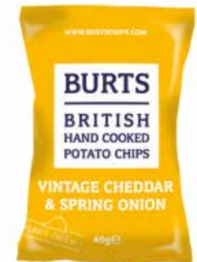
090547 Burts Vintage Cheddar & Spring Onion Potato Chips