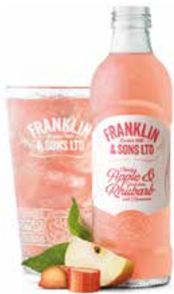
011076 Franklins Apple & Rhubarb