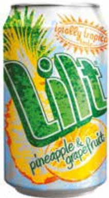
051737 Lilt Grapefruit & Pineapple