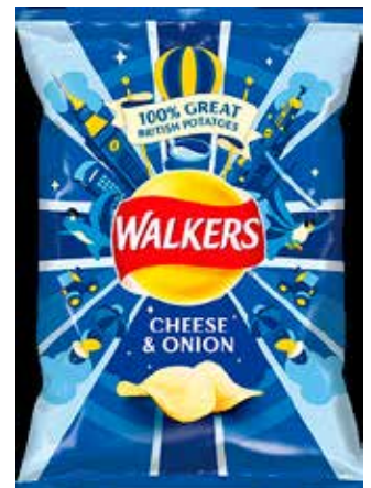
140944 Walkers Standard Cheese & Onion