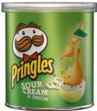
118626 Pringles Small Tube Sour Cream & Onion