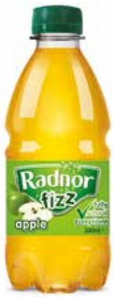
041558 Radnor Fruit Fizz Apple